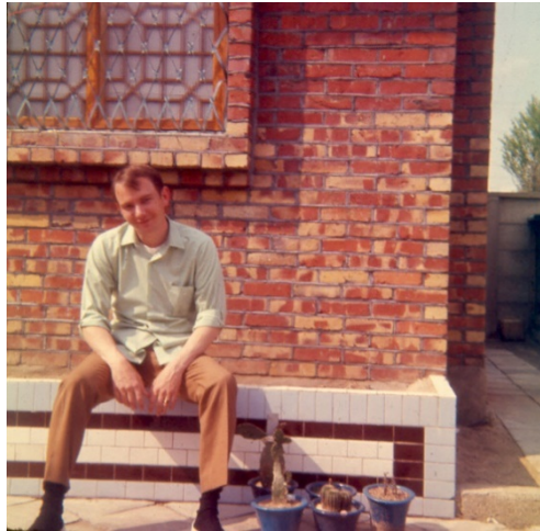
The Author at Home, 1971, Uijeongbu-si